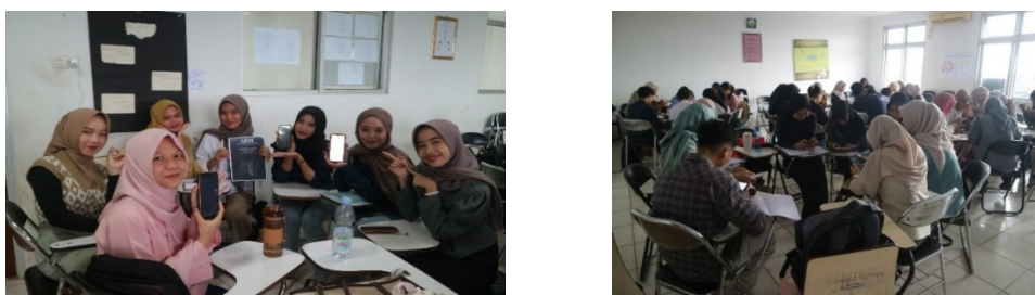
Figure 2. Field Trial Implementation

The practicality questionnaire yielded an average score of 96%, categorized as “very practical.”(Amraini et al., 2025), indicating that the LKM is easy to understand and supports independent learning. Student feedback suggested minor improvements in color harmony and image use. These results align with (Fitria & Afdaleni, 2024), who emphasized that appealing design and clear content enhance motivation and engagement. Overall, the developed PBL-based Physical Chemistry I LKM is valid, highly practical, and ready for final implementation as Prototype III. As shown in Figure 2, the field trial consisted of a pretest, LKM implementation, and posttest.