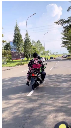
Figure 10: Experience attending popular Japanese culture exhibitions

Another example highlights an Indonesian influencer who attends a Japanese culture exhibition while wearing a kimono (Figure 10). The influencer's use of a Javanese accent while narrating her experience of participating in Japanese traditions underscores how different cultural practices can coexist within the same personal identity (Tang & Li, 2022). This Reel serves as an example of how users share their personal cultural journeys while presenting a multicultural identity as something normalized and celebrated (Wu, 2021). The kimono, Japanese exhibition setting, Indonesian narration, and Javanese accent produce a layered identity performance in which cultural admiration, bodily participation, and local voice coexist in one Reel.