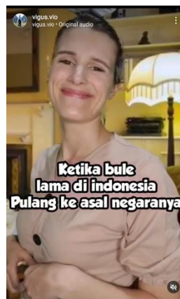
Figure 8: Parody of cultural shock experience

Parodies and wordplay in Instagram Reels are not just humorous but also reflective of the cultural tension and transcultural experiences that characterize the globalized world. They create a space where cultural norms and stereotypes can be examined and laughed at, often promoting a sense of shared humanity despite cultural differences.