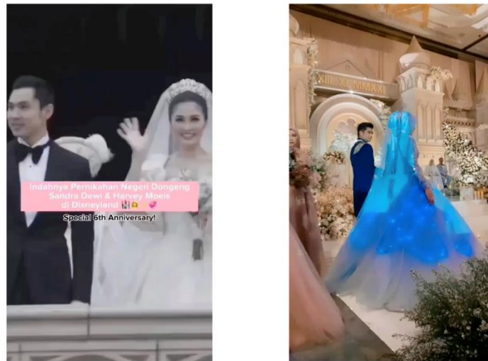
Figure 1: Cinderella wedding on Instagram Reels

This shift in wedding themes highlights how Instagram Reels serves as a platform for sharing these personal and yet globally influenced cultural experiences. By capturing such thematic weddings, influencers and users alike are able to share and reproduce cultural symbols that transcend national boundaries, bringing different people together through a shared cultural experience. These weddings no longer strictly adhere to a singular cultural identity but instead blend Western, Eastern, and personalized cultural motifs, creating new forms of wedding rituals that are widely accessible and recognized by global audiences. In terms of transculturation, the wedding becomes a site where cultural signs are detached from a single origin, recombined, and given new social meaning through digital visibility.