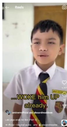
Figure 7: word guessing

Another important aspect of humour in Instagram Reels is wordplay, particularly homophones, which are words that sound the same but have different meanings. The statement mentions a word guessing game as a common comedic feature in Reels. These language-based games create humour by exploiting the ambiguities and quirks of language. In multi-lingual contexts like Indonesia, homophones can generate funny situations that play with the meaning of words, leading to misunderstandings or double meanings (figure 7). In word-guessing content, transculturality appears through the movement between languages and meanings: foreign words, regional accents, and Indonesian everyday expressions become playful resources for negotiating difference.