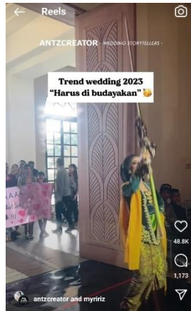
Figure 3: Casual Wedding in Instagram Reels

Another hybrid example is the majorette-led drum band performance during wedding ceremonies (Figure 3). The majorette, a distinctly Western style of parade performance, is integrated into Indonesian weddings, where it is paired with traditional Indonesian attire like the kebaya. This combination reflects how cultures are blending in real-time, facilitated by platforms like Instagram Reels. What might have once been seen as a divide between Western and Eastern practices is now a dynamic cultural negotiation, where wedding ceremonies become a place of cross-cultural expression.