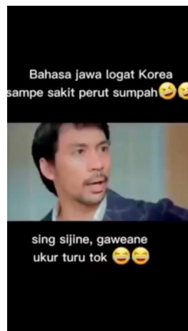
Figure 5: voice-over Korean movie with Javanese

This kind of cultural remixing is a common feature of Instagram Reels, where popular scenes from global media are "reinterpreted" through local lenses. This process adds layers of meaning, especially for audiences familiar with both the original media and the local culture. The hybridization of foreign and local cultures in Reels serves as a form of transcultural dialogue, where humour becomes a vehicle for sharing and negotiating cultural identities and experiences.