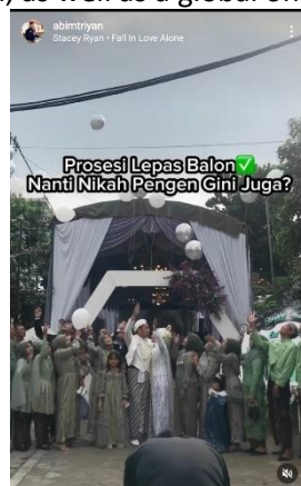
Figure 2: releasing balloons at wedding

For instance, the act of throwing flowers or releasing balloons (Figure 2), both symbols of celebration and joy, is increasingly common in Indonesian weddings. While these practices may have originated in Western traditions, they have now been fully integrated into Indonesian wedding customs, reflecting the broader trend of cultural hybridization. In this case, the wedding ceremony becomes fluid—drawing on both local and global influences to create an event that resonates on a more personal level, as well as a global one.