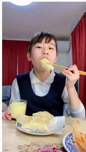
Figure 9: Cireng, local street food, for breakfast

For instance, the statement mentions a mixed Indonesian-Japanese family where a child is eating 'cireng' (a traditional Indonesian street food) using chopsticks, an act that symbolizes the blending of Indonesian and Japanese cultural practices (figure 9). In this context, Reels become a platform for negotiating identity, where families share not only the process of adaptation but also the joy and pride that comes from embracing multiple cultural influences. Analytically, this example matters because food becomes a marker of belonging and adjustment: a local Indonesian snack is inserted into an intercultural family routine and made visible to audiences who may read it as both ordinary and culturally specific.