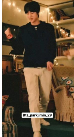
Figure 6: Meme of BTS boy-band

featuring BTS might be paired with local Indonesian music or an entirely different soundtrack, making the content both familiar and novel to followers (figure 6). In the BTS meme example, the globally circulated image of Korean idol culture is combined with Indonesian meme logic and local audience expectations. The result is a layered text in which global celebrity culture becomes material for local humor and social commentary.