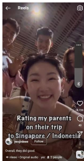
Figure 11: holiday with family

By sharing personal stories—like the example of a child ranking their parents (Figure 11) during a vacation—users create content that is relatable to a wide range of followers, offering insight into everyday intercultural experiences. These videos also serve as cultural education, helping followers understand different ways of life, family dynamics, and cultural practices in a manner that is engaging, accessible, and entertaining.